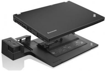
laptop (12 or 13") with a docking station * Easy laptop removal to swap into wireless network (i.e. going to a meeting)