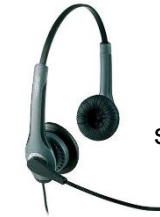
Headphone for Landline, PC, smartphone, tablet