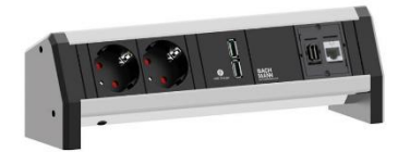
Desk power/data/USB management