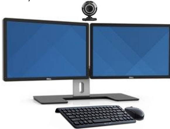
2 external monitors (22"), keyboard, mouse, web cam