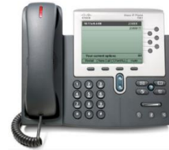
IP landline phone, call forwarding to smartphones and/or groups